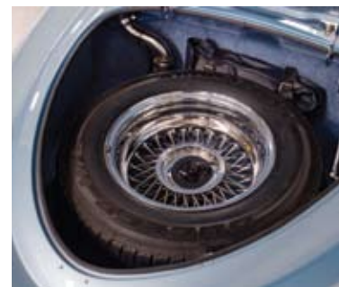
■ ABOVE The spare wheel leaves little spare room in the boot. ■ BELOW The Spyder's LS1 Chevrolet V8 hooks up to a four-speed automatic transmission.